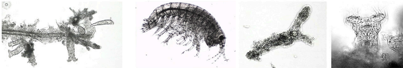
Latest examples of LiveSlide® microscope observations (40x-200x)

The LiveSlide® was created to improve the traditional and digital microscope experience when examining microorganisms of all types. The exceptional performance of the LiveSlide® offers higher magnification clarity, convenience, ease of handling and a uniform viewing well beyond what has been available in the microscopy world.